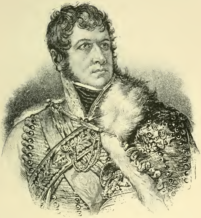
JUNOT DUC D'ABRANTÈS